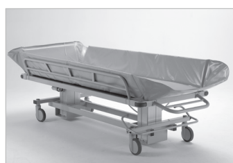
Head end rail folds for extra length